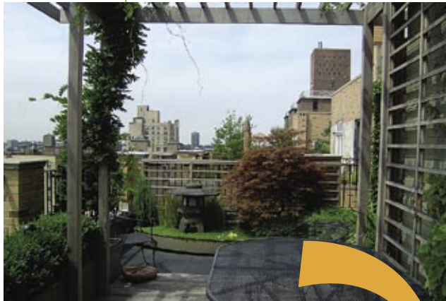
Upper West Side. Main garden east looking east.