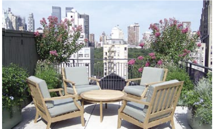
Madison Avenue. View of garden looking west.