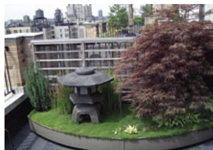
Upper West Side. Close-up of main garden.