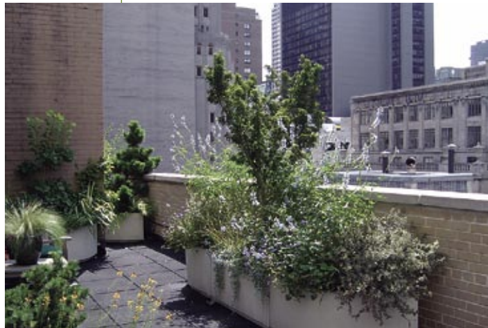
Central Park South. Rear garden, planters irrigated with BD button emitters and WPC drippers.